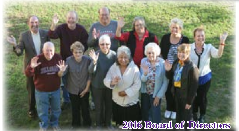
2016 Board of Directors