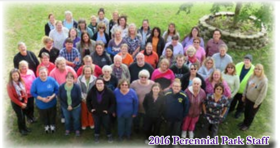
2016 Perennial Park Staff